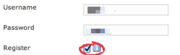
figure 1. Detail of the SIP Trunk form about the registration

The two configurations are parallel meaning that the Authentication method is not related with the encryption of the Trunk itself.