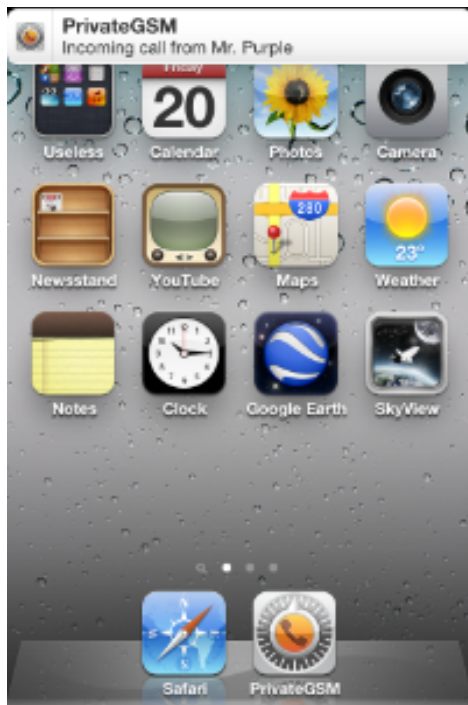
figure 2. Banner style notification