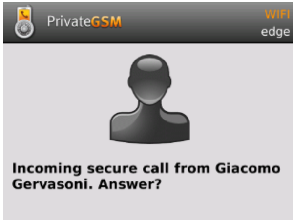
figure 1. Accept the secure call by pressing the DIAL button