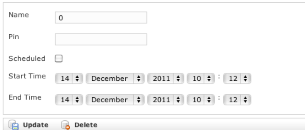
Figure 2. Edit Conference Room form

To correctly create a new conference room just insert into the Name field a number to be called and, if needed, a security pin to be dialled before entering the room.