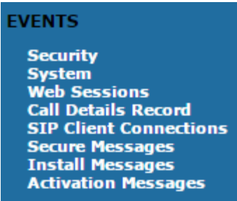
figure 1. the static logs menu

In this section we collect all the logs about events that has happened. This type of logs are written once the event has finished and do not represent a live photograph of the state of the service or of the appliance. They are mostly useful for debugging user's issues and provide support.