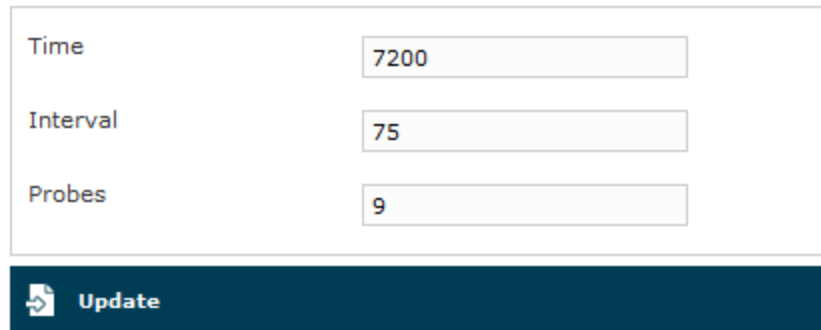
figure 7. TCP Keep Alive

The procedures involving keepalive use three user-driven variables: