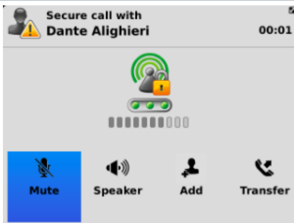
figure 1. BlackBerry

Call is automatically secured during call setup so it does not require any human intervention. As soon as call is established you can immediately start to talk with securely your peer. The overall security verification system is based on TLS digital certificate verification. PrivateWave automatically verifies digital certificate of SIP/TLS server and (if it's authenticated) then the connection will be automatically secured.