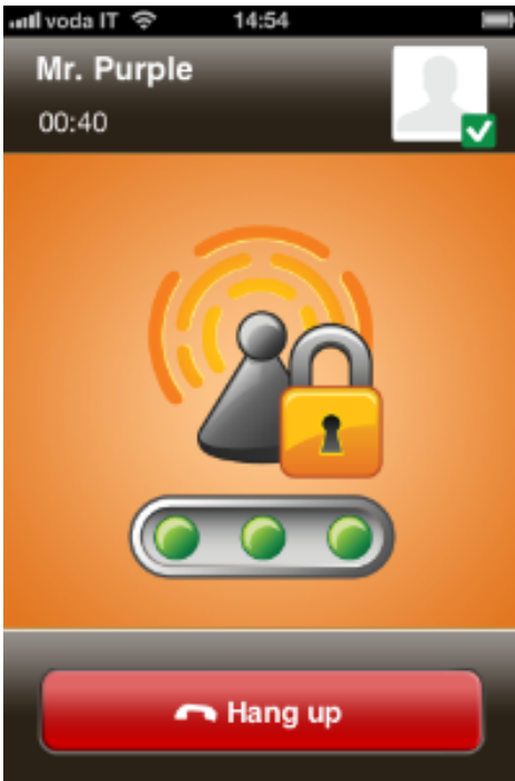
figure 3. iPhone

This security model is exactly the same as HTTPS with internet browser, given the fact that on PrivateServer there is a valid digital certificate the call can be considered secure. By default, PrivateGSM will not accept invalid SSL certificates, such as: